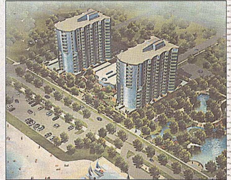
Nautica's amenities will include a garden terrace lounge, indoor pool with whirlpool and saunas, exercise room and manicured grounds.

for the winter and like to know that everything at home will be looked after," he says.