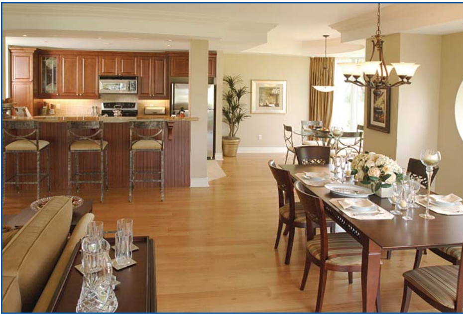
Nautica Model Suite decorated by noted Toronto design firm Hefele Makowka.

countertops, and roam the splendid master ensuite with whirlpool tub and Corian vanity. The innovative suite design and finishes in the model suite aptly illustrate why Nautica is Barrie’s ultimate waterfront residence.